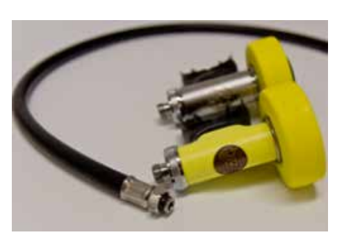
Cyklon Octopus (art. nr 2981)