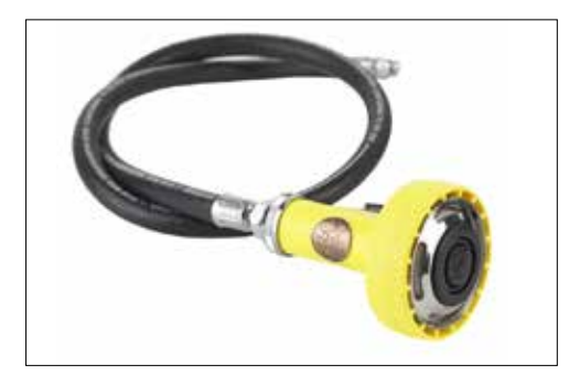
Cyklon Octopus (art. nr 2981) • 1 pcs second stage (art. nr 3536) • 1 pcs low pressure hose, 90 cm/35,4 inch (art. nr 2947)