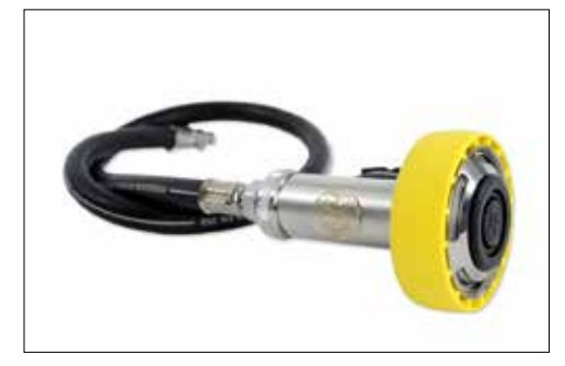
Cyklon Octopus (art. nr 2981M) • 1 pcs second stage (art. nr 3536M) • 1 pcs low pressure hose, 90 cm/35,4 inch (art. nr 2947)

If any of the above mentioned items are missing from the box, immediatly contact the shop where you bought the regulator.