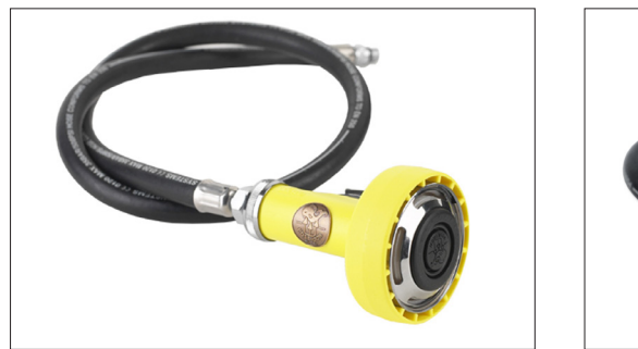
Cyklon Octopus (art. nr 2981) • 1 pcs second stage (art. nr 3536) • 1 pcs low pressure hose, 90 cm/35,4 inch (art. nr 2947)