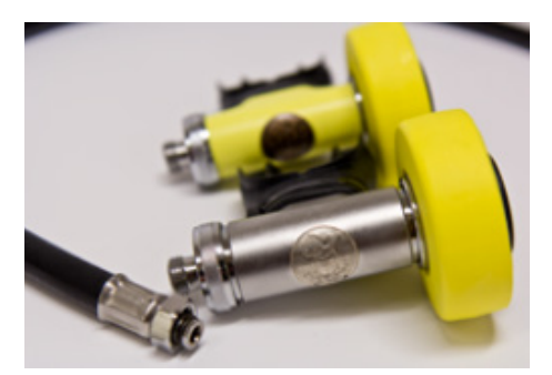
Cyklon Metal Octopus (art. nr 2981 M)