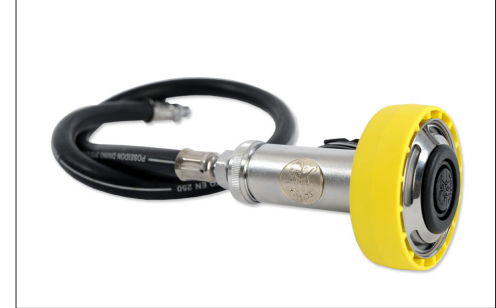
Cyklon Octopus (art. nr 2981M) • 1 pcs second stage (art. nr 3536M) • 1 pcs low pressure hose, 90 cm/35,4 inch (art. nr 2947)

If any of the above mentioned items are missing from the box, immediatly contact the shop where you bought the regulator.