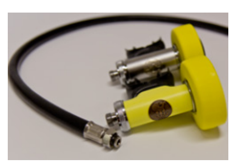
Cyklon Octopus (art. nr 2981)