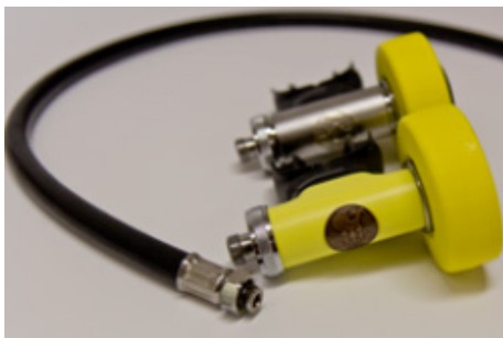
Cyklon X Octopus (art. nr 2981)