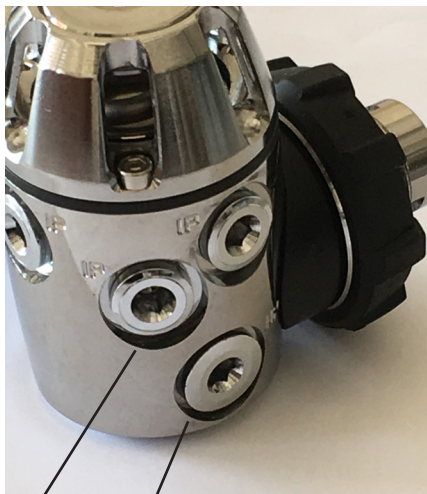
Low- and high pressure ports

Before you assemble your Cyklon X regulator, please pay attention to the following: