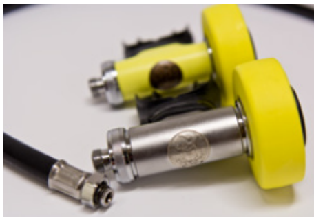
Cyklon X Metal Octopus (art. nr 2981 M)