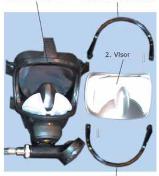
1. Lower visor clamp